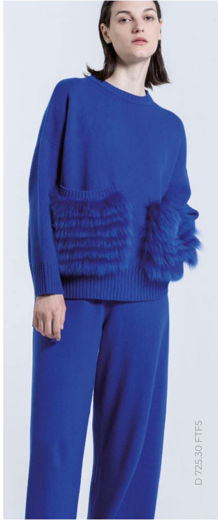
D 725.30 FTF5