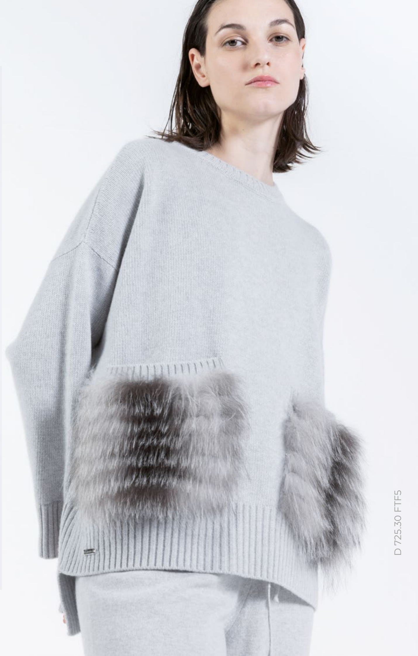
D 725.30 FTF5