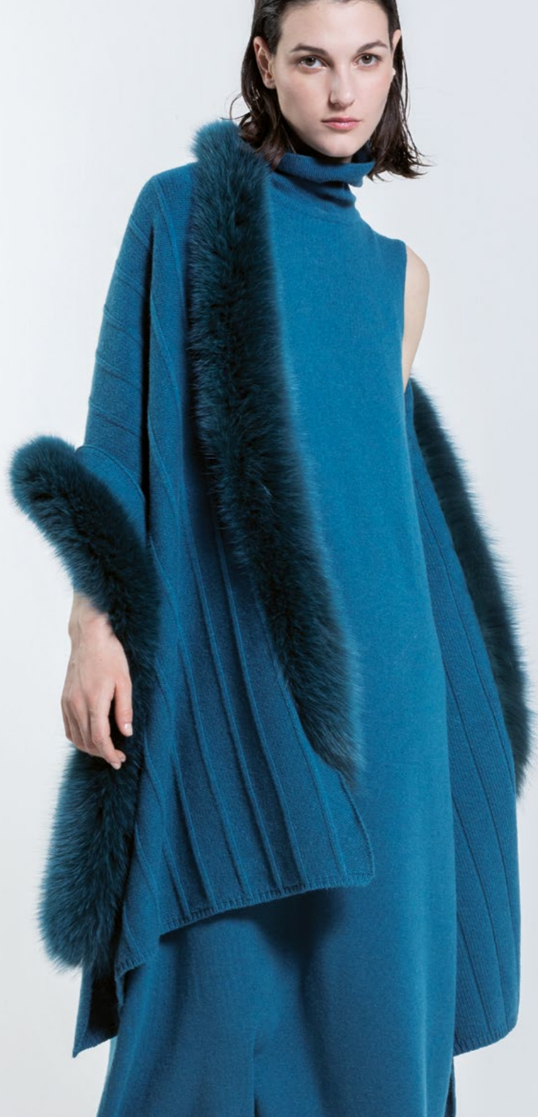
ST 735.10 2VO