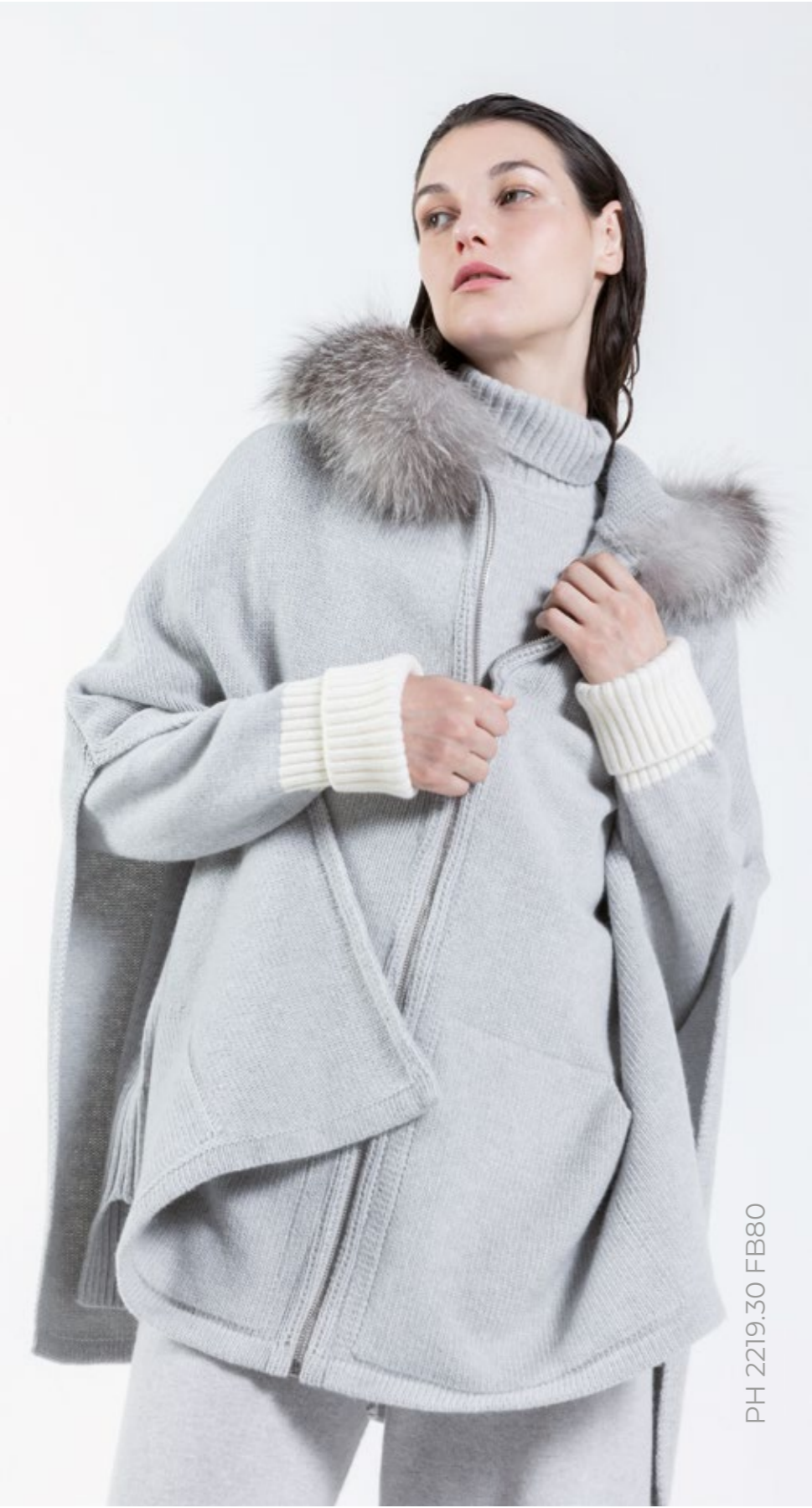
PH 2219.30 FB80