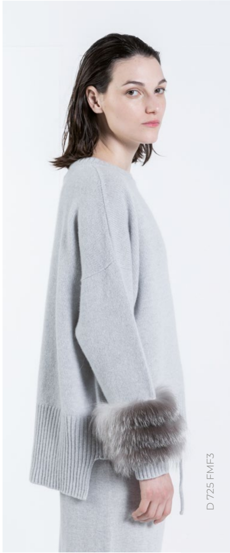
D 725 FMF3