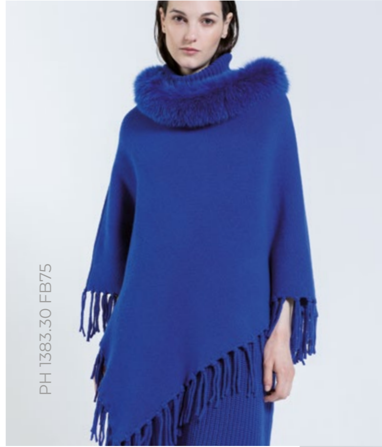
PH 1383.30 FB75